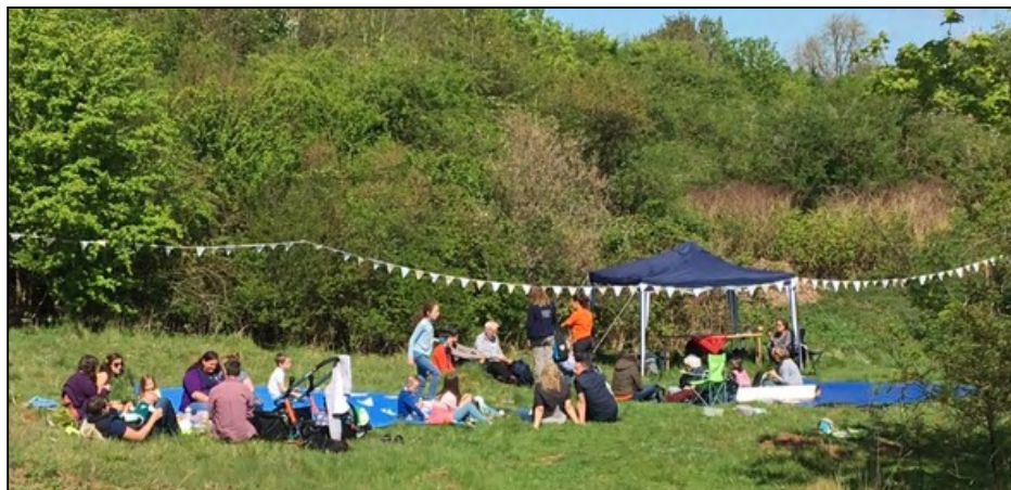
Above: Enjoying the picnic