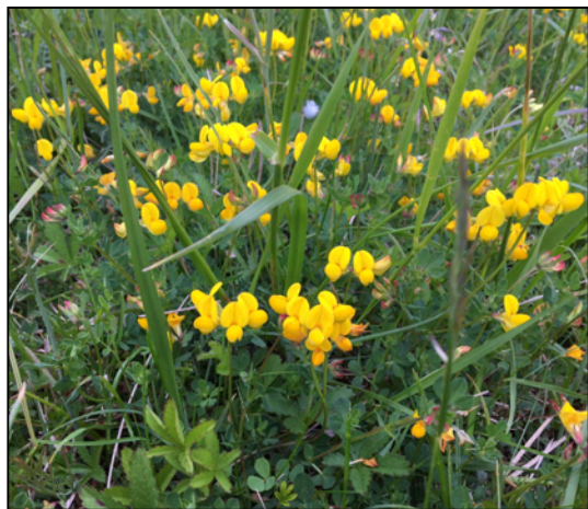
Bird's-foot trefoil – aka 'Eggs and Bacon' or 'Hen and Chickens'

Old Quarry: Manor Woods Valley working group, volunteers and Avon Wildlife Trust have been beavering away in the Old Quarry throughout the spring, cutting back new bramble growth, raking up the dead bramble material into piles, scarifying the soil and sowing grass and wildflower seeds. The aim is to restore it to the open area it was 15 years or so ago, with varied grasses and wild flowers and with open access to the old apple and pear trees. We've had terrific support from Becky Belfin, the Council's parks development officer, and