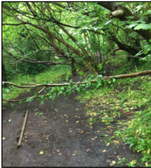
Left: Problem ...