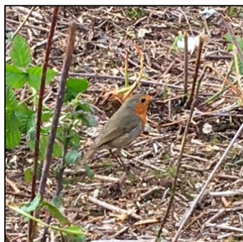
Left: The resident Old Quarry robin