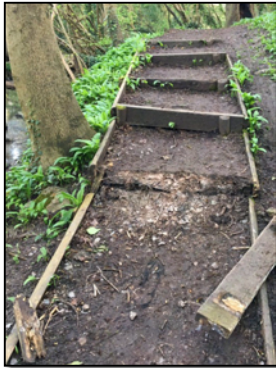
Left: Problem ...

Routine Maintenance: We can rely on the Council parks team to respond quickly to emergencies (like the incident with the burning car in the river in early May), but we occasionally need to help with more routine maintenance issues. For example, we mended the step in the woodland walk and removed a fallen branch that was blocking the path. Let us know if you see anything that needs to be fixed; if we cannot deal with it ourselves, we will ask for help from the Council.